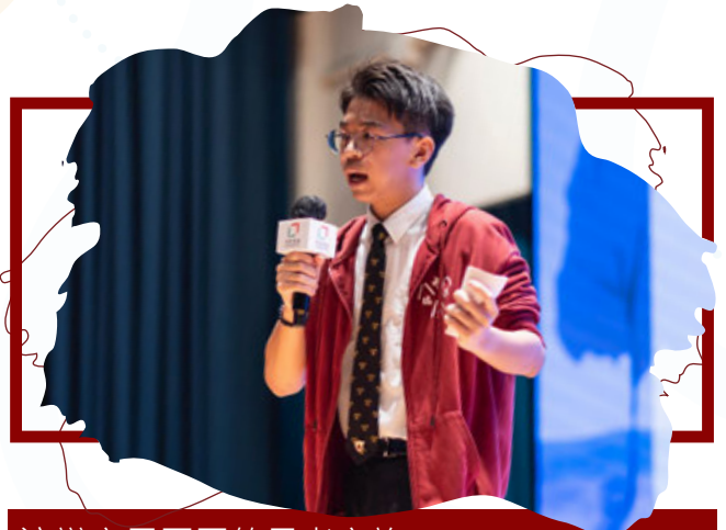
演辯之星冠軍的患者之旅

最後，作為瑞祺中辯的隊長，在此亦盼望瑞祺中辯能再創佳績。未來的路還有很長，只要懷着謙卑受教的態度和不屈不撓的信念，我深信瑞祺中辯必會再創輝煌！