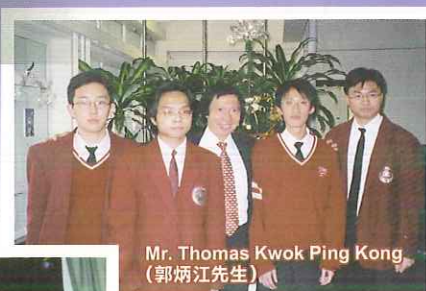
Mr. Thomas Kwok Ping Kong (郭炳江先生)