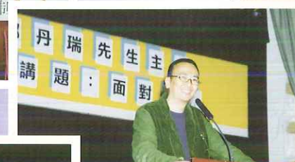
Mr. Lawrence Cheng Tan Shui (鄭丹瑞先生)